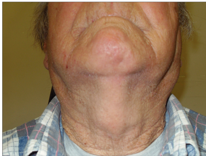
Figure 1. Patient with bilateral parotid enlargement and liposubstitution seen upon MRI.

would justify them, after the pertaining diagnostic investigation, by means of an image exam, laboratorial and/or anatomic-pathological tests (Figure 1). In these cases, our investigation encompasses a complete blood count, antiSSB, anti-nucleus factor, rheumatoid factor, HIV, anti-HCV, Schirmer test, minor salivary gland biopsy, neck MRI, scintigraphy and, in selected cases: sialography.