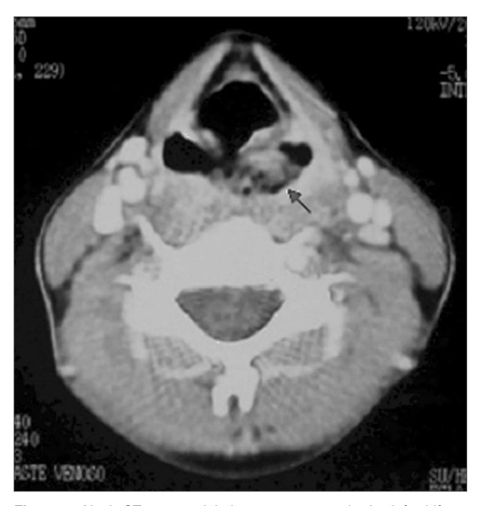
Figure 2. Neck CT scan, axial view: tumor mass in the left piriform cavity.

the prescription of many antibiotic agents in association (ceftazidime, amikacin, imipenem, vancomycin, amphotericin B e fluconazole).