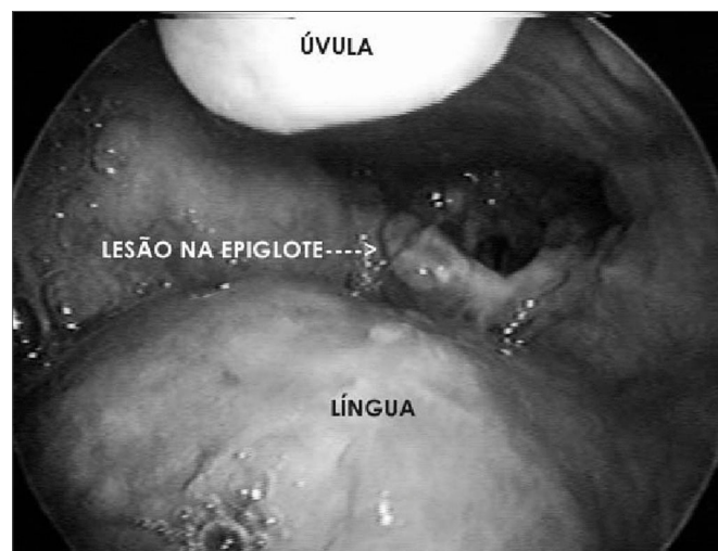
Figure 1. Lesion on the right upper surface of the epiglottis - laryngeal histoplasmosis.

The patient came with hoarseness, progressive dysphagia, and having lost 10Kg in 2 months. He had had AIDS since 1996. At admission his blood work up showed 2 CD4 + lymphocytes per mm 3 . Direct laryngoscopy was carried out and showed a white necrotic lesion spread throughout his larynx, edema and exophytic lesion in the upper right border of the epiglottis. We biopsied the lesions. We did not observe lesions on the skin. His adrenocortical, myelogram, CSF, ecocardiogram and skull CT scan were all normal. The result was histoplasmosis. The