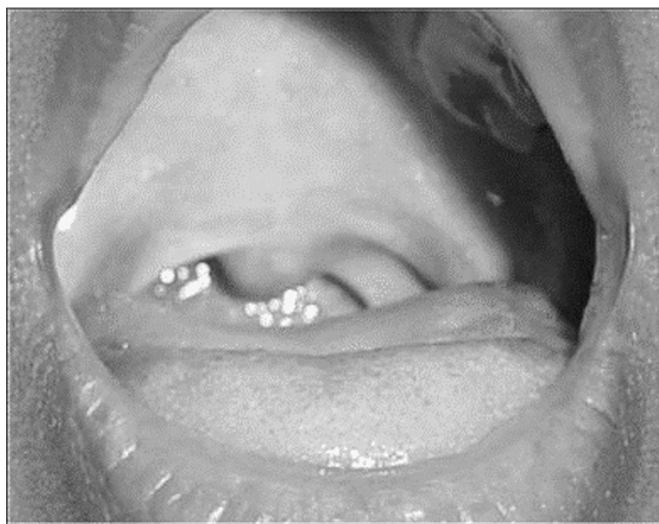
Figure 3. Oropharynx after treatment.