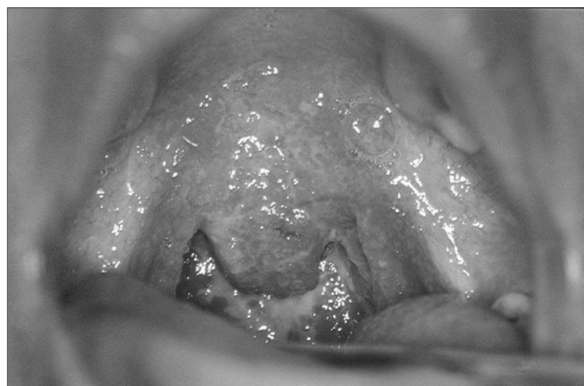
Figure 1. Granulomatous infiltrate in the oropharynx.

Physical exam: 16-week pregnant patient had soft palpable and painless nodes in her left sternocleidomastoid region, without signs of infection or fistula. In the oropharyngoscopy we noticed a granulomatous, hyperemic, friable lesion, involving the soft palate, uvula, tonsils and the posterior pharyngeal wall, especially on the right side, without secretions or ulcerations (Figure 1). The rest of her oral cavity did not show alterations.