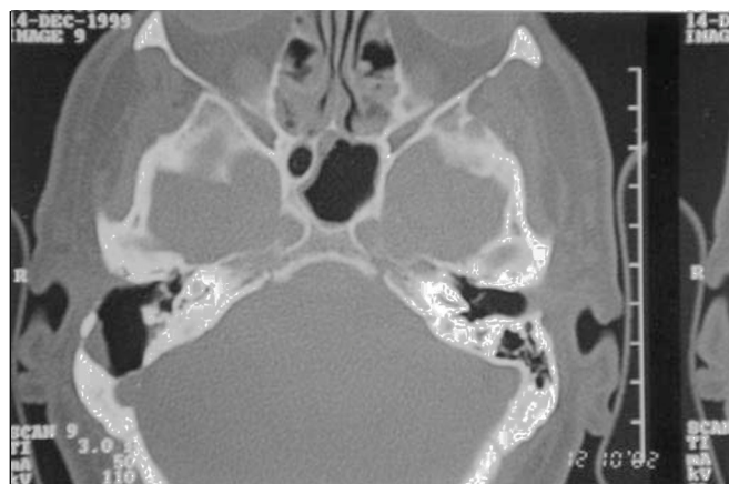
Figure 1. Temporal bone axial CT scan showing contact of the cholesteatoma's capsule with sigmoid sinus and meninges.