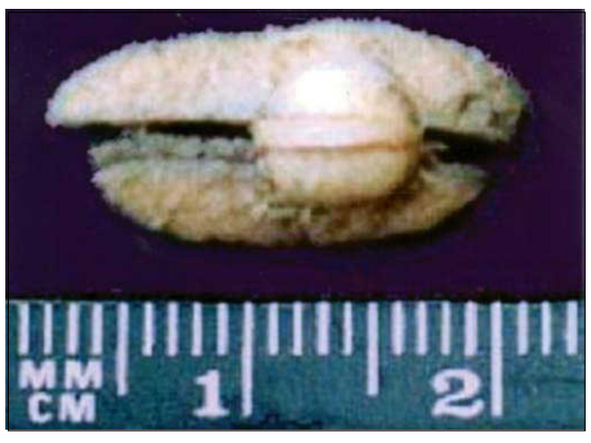
Figure 1. Aspect of cutaneous nodule removed from the dermis of submandibular region (2nd lesion).

parotid, we can consider the following diagnostic hypotheses for differential diagnosis: 1) metastasis of breast ductal carcinoma owing to the presence of apocrine differentiation that may take place in the tumor, in addition to the fact that the breast is a frequent site of primary tumor in infraclavicular anatomical location, generating metastases to the parotid <sup>7,8</sup>; 2) metastasis of cutaneous apocrine carcinoma that has marked apocrine differentiation 5-7; 3) salivary gland ductal carcinoma, whose basic aspect is to have some similarities such as the fact that neoplastic cells present abundant eosinophilic and granular cytoplasm, with increased nuclei and prominent nucleoli, forming micropapillary arrangements or comedo-necrosis foci 9,10; and 4) renal cancer metastases, in which neoplastic cells also have abundant eosinophilic and granular cytoplasm, which can also present areas of papillary differentiation <sup>7,8</sup>.