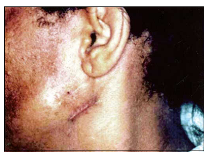
Figure 2. Small tumor in parotid region (3rd lesion). We can also observe the surgical scars of previous lesions removed.