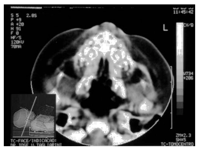
Figure 5. Evidence of central incisors.

Mild cases of CSPA, after diagnosis, can be treated more conservatively, with humidification and topical nasal decongestants <sup>1,8,11</sup>. Severe cases, such as the one presented, require surgical approach 1-8, 11. Surgical repair of CSPA comprises resection of inferior margin of the bone in anterior nasal aperture, which can be made by two accesses. Transnasal access has been used in adults and it is technically more difficult in neonate noses. Sublabial approach using microscope, as performed in this case, allows excellent visualization and preservation of nasal mucosa. Nasolachrymal ducts should be dissected and preserved. We should be careful at the level of the nose floor to prevent damage of dental germens<sup>1,11</sup>. The aperture bone should be worn out sufficiently to widen pyriform aperture and allow passage through nasal fossa lumen of an endotracheal tube of 3.5mm<sup>11</sup>. We recommend the use of a stent for a period of 1 to 4 weeks and in this patient we used a splint formed by sylastic and fixed to the nasal septum with nylon stitches <sup>1,8,11</sup>. We made a mucosa incision on the floor of the fossae to allow adaptation of the mucosa to the new nasal fossa dimension. Potential surgical complications include damage to dental germens and lachrymal duct, which can be