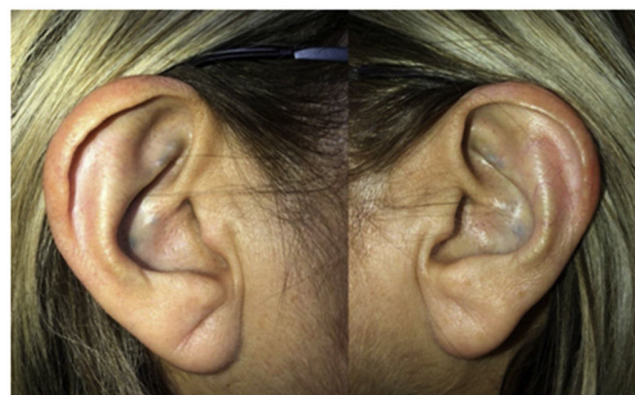
Figure 1 Bilateral green-black pigmentation of auricula.

A 62-year-old female patient admitted to the dermatology clinic for discoloration of the auricle for 2 years. The patient