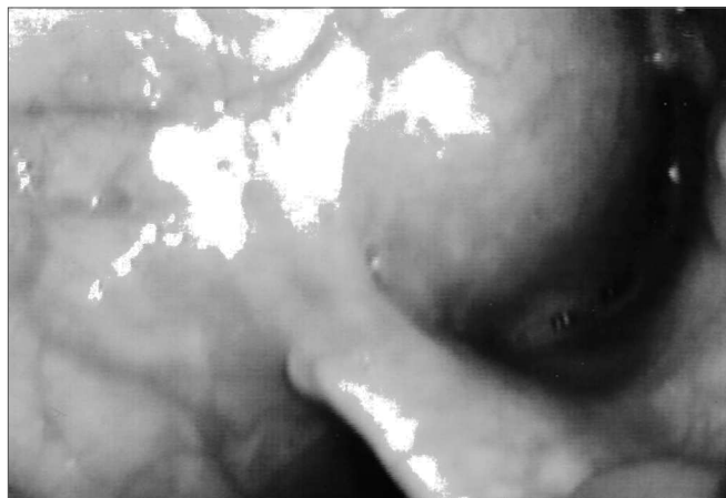
Figure 2. Laryngocele's internal part. Videolaryngoscopy showing the tumor occluding the laryngeal vestibule, hiding the piriform sinus.