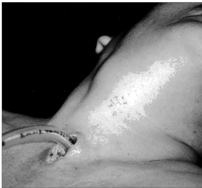
Figure 1. Laryngocele's external part. Notice the neck mass on the right. At this point the patient is already tracheostomized.

Our patient was a 45 year old female, housewife, seen in May of 2002, complaining of dysphonia for 40 days, associated with snoring. She did not smoke or had any pulmonary disorder, nor had she had prior laryngeal problems. During physical exam, she had a mass in her right cervical region (Figure 1) and during the laryngoscopic exam she had a bulging near the ventricular fold and the right aryepiglottic fold (Figure 2). We ordered a CT scan and an MRI (Figures 3 and 4) which revealed a large cystic lesion filled with air, thus confirming the diagnosis of laryngocele. In late June of 2002, while she underwent preoperative exams, she was having intense