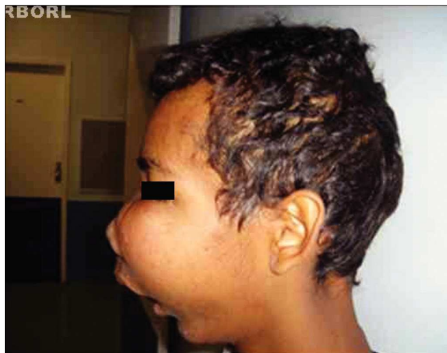
Figure 1. Recurrence of maxilla ameloblastoma.

The mandible was the most affected site. Nineteen (47.5%) patients had tumors restricted to the mandible body. Of these, five (12.5%) went beyond the mid-line. Eight (20%) had involvement of the mandible body and angle or angle and ramus; in 10 (25%) cases the lesion advanced to the body, angle, ramus and condyle; and three cases (7.5%) involved the maxilla - a less frequent location (Figure 1).