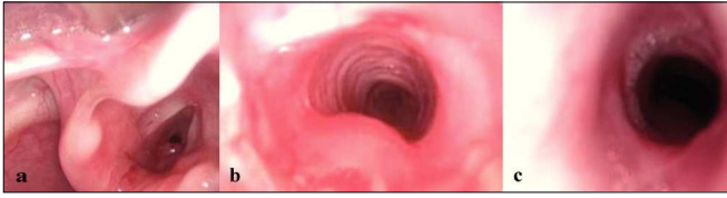
Figure 3. Patient with grade 3 subglottic stenosis and granulation tissue (3A), submitted to balloon laryngoplasty (3B – image taken immediately after dilatation, and 3C – image taken 2 weeks after the procedure, with residual grade 1 stenosis - posterior).