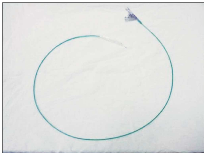
Figure 1. Angioplasty catheter used in the balloon laryngoplasty.

First, we carried out a direct laryngoscopy in order to diagnose and grade the SGS, using pediatric laryngoscopes and a scope of 0 degree and 4mm in diameter. The patient was sedated and remained in spontaneous ventilation during the procedure, receiving complementary oxygen through a nasal catheter. After the diagnosis and indication of balloon dilatation (acute stenosis in evolution, with granulation tissue, lower than grade 4), we introduced the balloon (angioplasty catheter - 4cm long and 10-14mm in diameter - Figure 1) through the laryngoscope, under direct view. The balloon was placed in the subglottis (Figure 2) and inflated with saline solution to a pressure of 2atm. The balloon remained inflated for 30 seconds and 2 minutes, and afterwards it was emptied and removed from the airway.