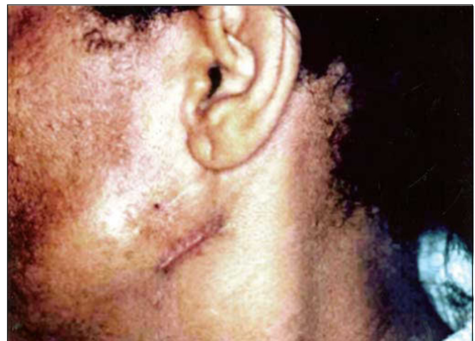
Figure 2. Small tumor in parotid region (3rd lesion). We can also observe the surgical scars of previous lesions removed.