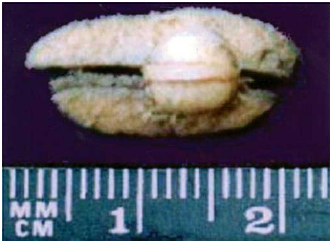
Figure 1. Aspect of cutaneous nodule removed from the dermis of submandibular region (2nd lesion).

parotid, we can consider the following diagnostic hypotheses for differential diagnosis: 1) metastasis of breast ductal carcinoma owing to the presence of apocrine differentiation that may take place in the tumor, in addition to the fact that the breast is a frequent site of primary tumor in infraclavicular anatomical location, generating metastases to the parotid 7,8 ; 2) metastasis of cutaneous apocrine carcinoma that has marked apocrine differentiation 5-7 ; 3) salivary gland ductal carcinoma, whose basic aspect is to have some similarities such as the fact that neoplastic cells present abundant eosinophilic and granular cytoplasm, with increased nuclei and prominent nucleoli, forming micropapillary arrangements or comedo-necrosis foci 9,10 ; and 4) renal cancer metastases, in which neoplastic cells also have abundant eosinophilic and granular cytoplasm, which can also present areas of papillary differentiation 7,8 .