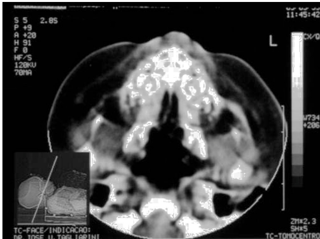
Figure 5. Evidence of central incisors.

Mild cases of CSPA, after diagnosis, can be treated more conservatively, with humidification and topical nasal decongestants 1,8,11 . Severe cases, such as the one presented, require surgical approach 1-8, 11 . Surgical repair of CSPA comprises resection of inferior margin of the bone in anterior nasal aperture, which can be made by two accesses. Transnasal access has been used in adults and it is technically more difficult in neonate noses. Sublabial approach using microscope, as performed in this case, allows excellent visualization and preservation of nasal mucosa. Nasolachrymal ducts should be dissected and preserved. We should be careful at the level of the nose floor to prevent damage of dental germens 1,11 . The aperture bone should be worn out sufficiently to widen pyriform aperture and allow passage through nasal fossa lumen of an endotracheal tube of 3.5mm 11 . We recommend the use of a stent for a period of 1 to 4 weeks and in this patient we used a splint formed by sylvastic and fixed to the nasal septum with nylon stitches 1,8,11 . We made a mucosa incision on the floor of the fossae to allow adaptation of the mucosa to the new nasal fossa dimension. Potential surgical complications include damage to dental germens and lachrymal duct, which can be