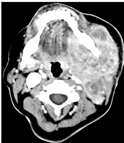
Figure 2 CT scan: Locally advanced left submandibular gland tumor.

gland, involving the mandible without apparent bone invasion, and extensive necrotic tissue with infiltration of the floor of the mouth (Fig. 2). PET/CT showed a lesion involving the left submandibular gland (SUV mtox: 17.1) and cervical lymph nodes at level II, III, V on the left and